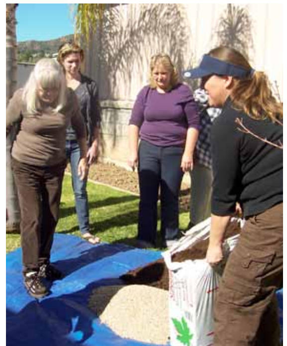
Attendees at our Square Foot Garden Workshop teamed up to prepare the Bartholomew soil mixture for our 4x4 foot garden frame.

Biography: I'm a 76 year old single grandma/mom living in Arcadia, CA, raising my 15 year old granddaughter and enjoying my new square foot garden project in my 25 ft by 25 ft backyard. That's plenty of space to experiment, with plans to make it into a teaching garden for the community and for nearby schools. I'm on the Azusa Community Garden planning committee, to be officially open