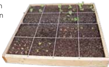
Square foot garden, one month later.

soon for Azusa residents. I teach square foot gardening workshops at the Los Angeles County Arboretum. I just did a workshop to help launch a square foot garden project for the Los Angeles Unified School District after school program. I did a workshop for the Schools' Agriculture and Nutrition Program — AgFair people who sponsor an annual fair at the L.A. County Fairgrounds in April 12-16. You can find out more about them at www.agfair.org . I'm working on my biggest project ever, planning to have a square foot garden with 34 4' x 8' plots on the rooftop of Union Rescue Mission in downtown Los Angeles, to help feed the homeless. I'm available to do talks and workshops on request.