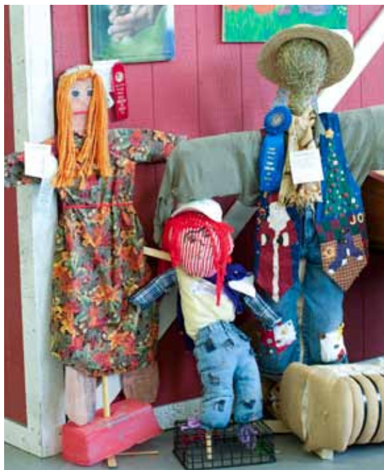
Seasonally dressed Scarecrows at the Fair.

Farm Day at Mt San Antonio College, 9am – 3pm! Come visit the farm on campus, see demonstrations and enjoy a hayride.